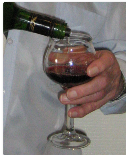
The Perfect Pour in action