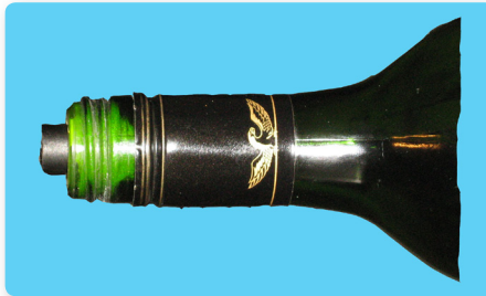
The Perfect Pour

An initiative of the Queensland Government’s Department of Employment, Economic Development and Innovation, the Inventor Service includes a range of online assessments, guides and templates, as well as a one hour consultation with a AIC Commercialisation Consultant.